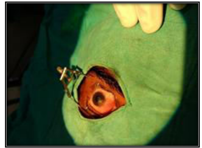
Figure 1:Pterygium before surgery

group were asymptomatic after 2weeks.One patient in the suture group had partial graft dislodgement developed inferiorly and a conjunctival defect that resolved after 2 weeks.One patient in fibrin glue group had extensive sub conjunctival haemorrhage under the graft,which resolved after 3 weeks.Granuloma was seen in one case in suture group, which resolved after suture removal.No recurrence was seen in both the groups.