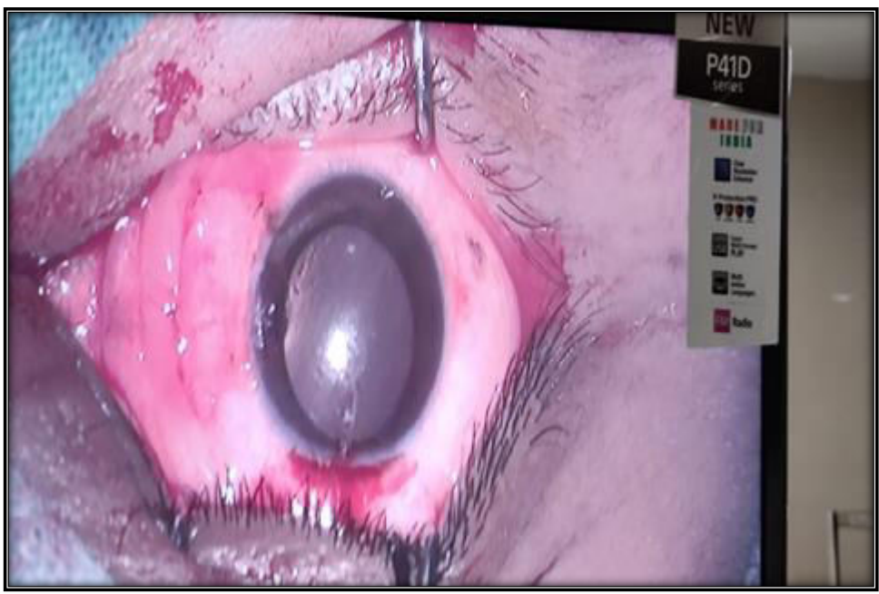
Figure 4: Conjunctival grafting with sutures