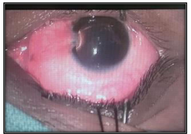
Figure 3: Pterygium before surgery