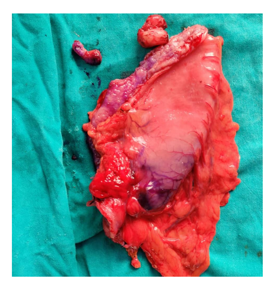
FIG 3: Gross specimen of the resected tumour and stained lymph nodes