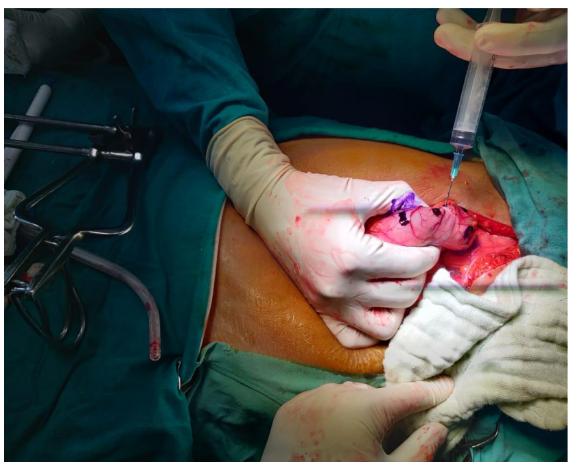
FIG 1: Injection of methylene blue dye into the tumour (intralesional)

Intraoperative subserosal/perilesional injection of sterile methylene blue at 4-6 locations of the tumor was given and lymph node staining by dye was looked for (Fig 1).First lymph node to take the dye was considered as sentinel lymphnode(Fig 2). Histopathological analysis of the lymph node was done along with other lymph nodes dissected during the procedure and number of lymph nodes with and without metastatic tumor deposits was correlated with presence or absence of staining.