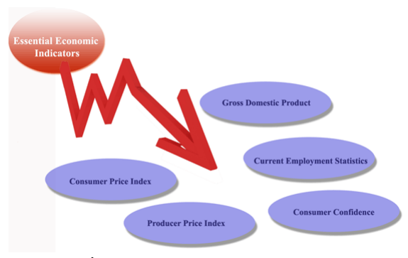
Figure 1. small business economics

A small scale business based on capital and labour used in that business. On the basis of these attributes the business is divided in small, medium and large scale business [1]. In small business there are sole proprietorships, privately owned corporations and small number of partner [2]. Small business have less number of employees, members and less annual revenue that a large or medium size business [3]. Small business support on a small level to the government.