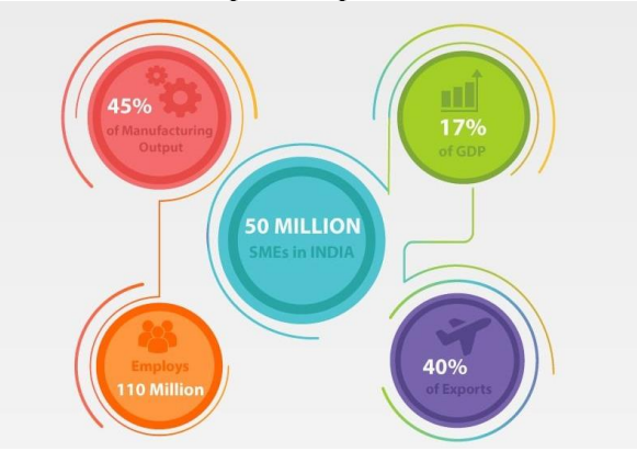
Figure 2. Role of small business in economy

In this type of category the investment of capital is up to 25 lakh.