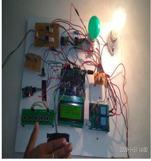
Fig 3. Output of the Ultrasonic sensor.

The above fig.3 shows the output of the system