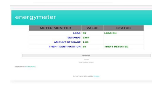
Fig 4. Webpage display.

ISSN 2515-8260 Volume 07, Issue 11, 2020