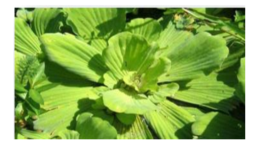
Figure 1.1. General view of pistachio