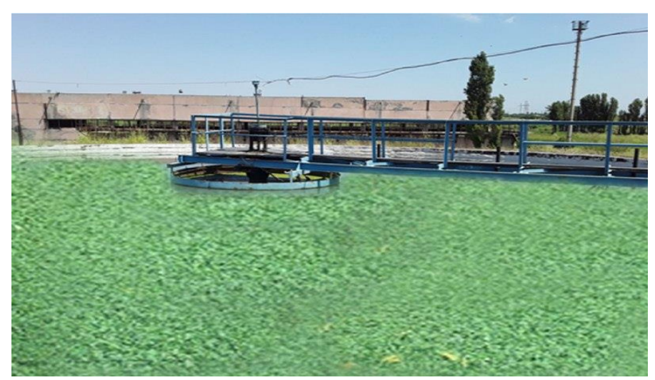
Figure 3. Appearance of a pistachio plant in a biological pool

From the above results, it can be concluded that the results of laboratory experiments assimilated various substances from wastewater into Bekabad city sewage treatment plants through the roots of eucalyptus and pistachios. The results of the experiment showed that pistachio can be used for its production due to its high cleaning properties. We continued to experiment with pistachios due to the high purification properties of aquatic plants in the laboratory. Experiments at the Bekabad city water treatment plant continued from July 15 to August 15, 2019, during which morphological observations were carried out on pistachio. Observations show that in the first three days the leaves of the pistachio plant turn yellow, and from the 5th day after adaptation to this water the pistachio grows back, and from the 10th day it grows well and grows from 13 to 10 cm.) At the end of the experiment, it was noticed that the leaves grew to a size of 16-18 cm and strengthened the roots. Observation results show that during the experiment, the pistachio plant grew very quickly and covered the surface of the structure in 20 days. In addition, the volume of vegetation has increased.