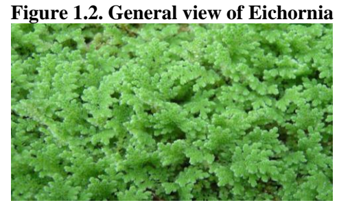
Figure 1.4. General view of azole

The physical and chemical properties of aquatic plants in aquifers before and after cultivation were determined by the following methods: Water temperature, aqueous and acidic environment, Water odor, Determination of dryness of water, Determination of total nitrogen, Method for determination of sulfate ion, Determination of phosphorus oxide Yu.Yu. Lurie [18, 19], Strogonova N.S. [12].