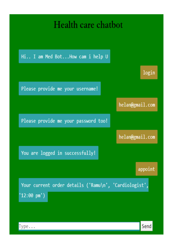
Figure 6. Text to text diagnosis bot engages in conversation with the patients regarding their medical issues