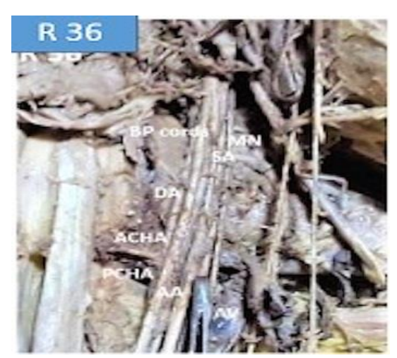
Figure 5: Variation 5