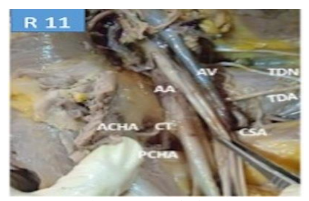
Figure 3: Variation 3