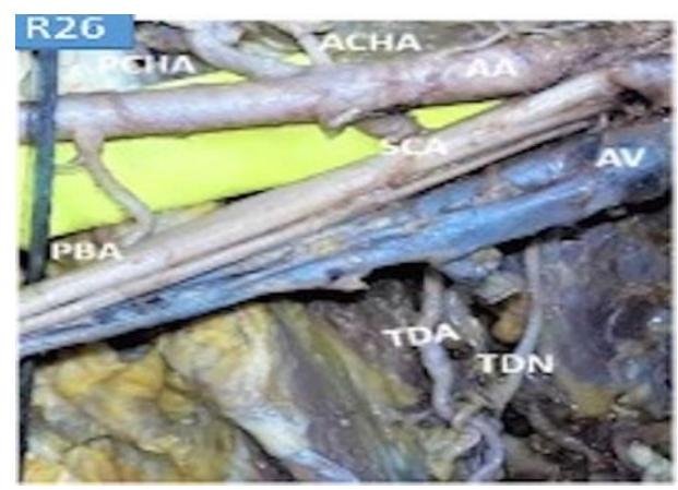
Figure 2: Variation 2