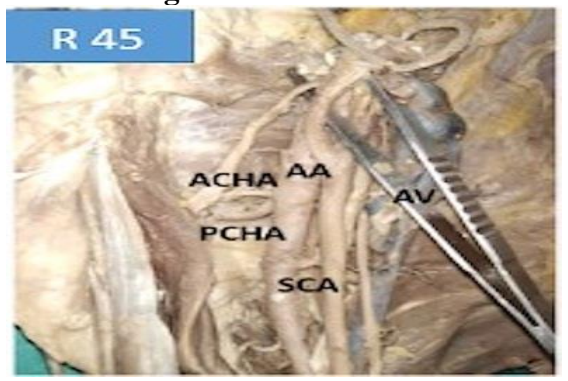
Figure 4 : Variation 4