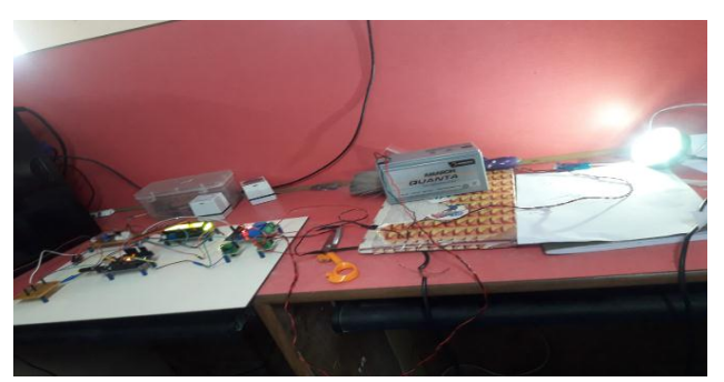
Fig: Snapshot of Hardware Output

Here Load 1 indicates Light and cargo 2 indicates Fan.