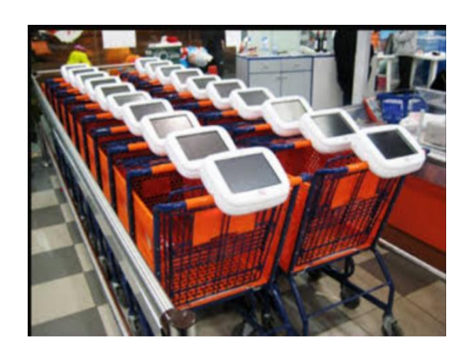
Fig. 4.1 Smart trolley