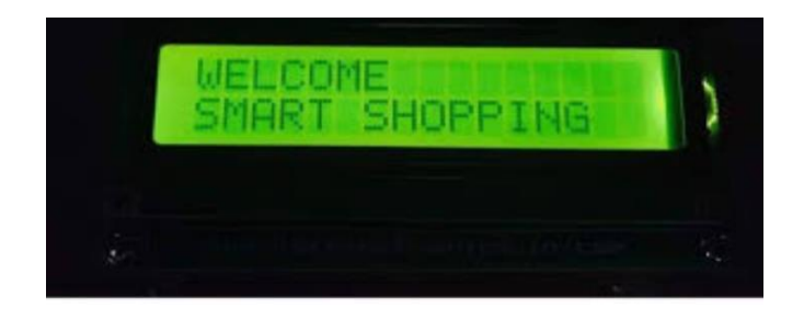
Fig. 4.3 LCD Screen