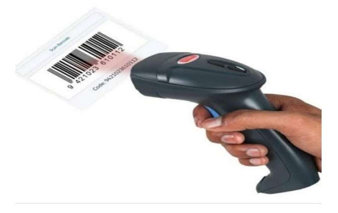
Fig. 3.1 Barcode Scanner

In the existing system, they have used the traditional method of barcode scanning. Using the Fig [3.1] barcode scanner we need to scan each product and so this method becomes very slow to be scanned. A barcode reader is associate in electronic device for reading with the barcodes. In this process we have no automatic billing system and the customer has wait for the billing process in the long queues. Therefore, using the barcode process billing method is slow. This eventually results in the long queues. To avoid the process, we introduced types of technology is the RFID based billing system. User can pay the amount through credit/debit cards or by cash. But it is the time consumption process for the billing purpose. So, the waiting time to pay the bill is increased. To overcome, the time consumption process the RFID based smart trolley system is proposed.