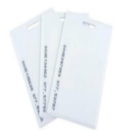
Fig. 4.2 RFID Tag