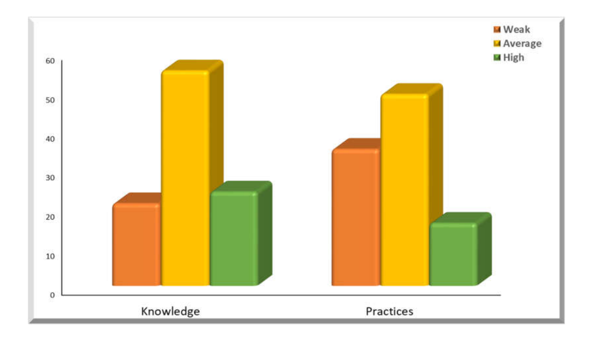
Figure (1) Distribution of knowledge and practice regarding standard precautions of infection control

had average information were (49.0%) while weak knowledge were (35.0%) the data ranged from (3-9) by mean \pm SD(6.88 \pm 2.481).