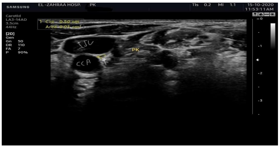
Fig 2: High-resolution ultrasonography (HR-US) of vagus nerve in the carotid sheath between the common carotid artery and the jugular vein in Son of Parkinson patient showing (CSA 0.01 cm2) hypotrophy.

Fig 1 : Transcranial sonography of the midbrain through a temporal bone window in Son of Parkinson patient . We identified the butterfly-shaped midbrain , and manually encircled the interior hyperechogenic area of substantia nigra . It is 0.27cm2 (hyperechogenic SN ).