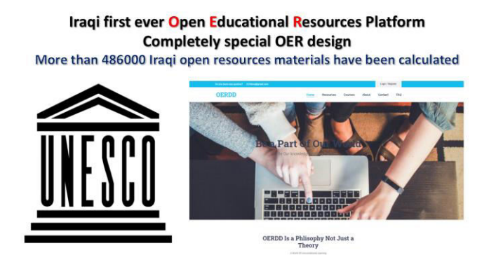
Figure no.6: MOHESR OERplatform

21- Build and complete Iraqi first OER platforms, since we have decide as a ministry to move forward to blended learning, and we have now more than 480000 open resource refrence have been prepeared by Iraqi academics. (figure no.6)