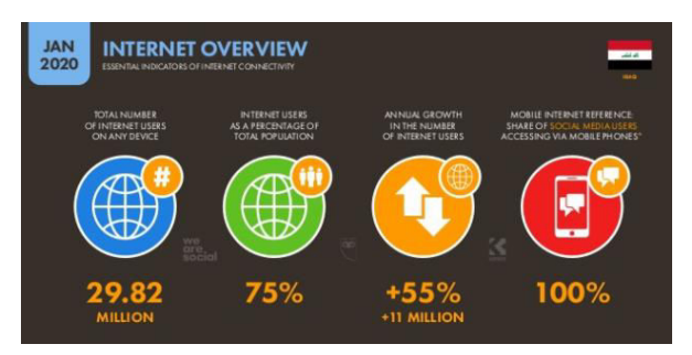
Figure no. 1: Internet in Iraq facts using

Everything in the educational systems, in all of the worlds is changing quickly after covid-19. Education systems nowadays are different from the same last three months ago, and they follow the ICT revolution and gain the required benefits from its new productions. Schools and Classrooms are changing urgently nowadays in order to meet the new educational technologies using requirements, and away from rows of desks, to an environment that advertises cooperation between learners, teachers and learning tools. Learning environments are now preparing learners for their destined work condition and environments in the future after graduation from schools. These new classrooms called Optimized Digital Classroom. [1].