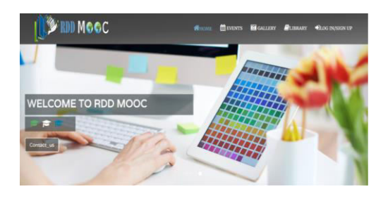
Figure no.8: MOHESR MOOCRDD platfrom-2

24- Focusing on e-learning content industry and start using SCROM standards and build the culture of the e-learning industry. (figure no, 9)