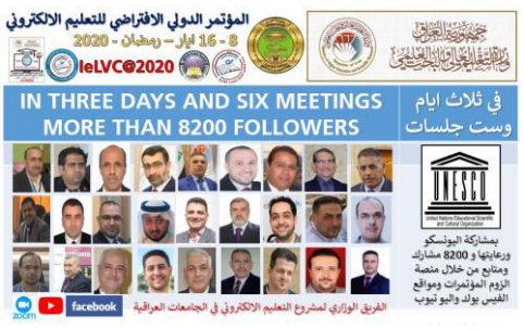
Figure no. 5: Iraqi international virtual conferece flags and some keynote speakers

21- Build and complete Iraqi first OER platforms, since we have decide as a ministry to move forward to blended learning, and we have now more than 480000 open resource refrence have been prepeared by Iraqi academics. (figure no.6)