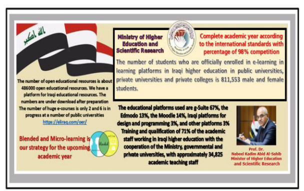
Figure no.3: MOHESR Minister Achievments letter

Within 3 months only, higher education in Iraq reach a rate that bypasses 98% of the project aims. As shown in figure no.3.