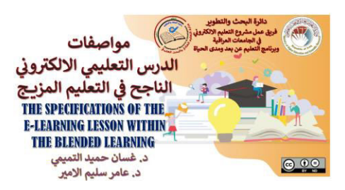
Figure no.9: MOHESR e-content standard specifications

24- Focusing on e-learning content industry and start using SCROM standards and build the culture of the e-learning industry. (figure no, 9)