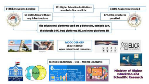
Figure no.4: MOHESR Achievments

16- IHE stand up now on 98% of e-learning Adoption and it was achieved tby real HARD WORK.(figure no.4).