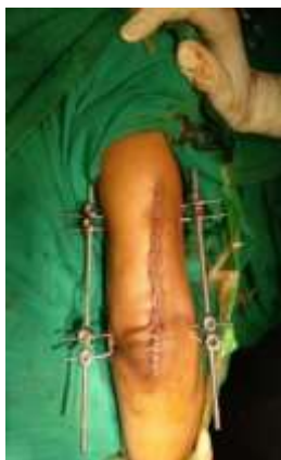
Fig : Final construct of JESS