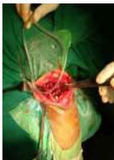
Fig : Identification of ulnar nerve & exposure of fracture site