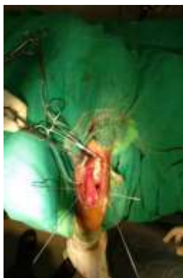
Fig : Fixation of fracture with k-wires