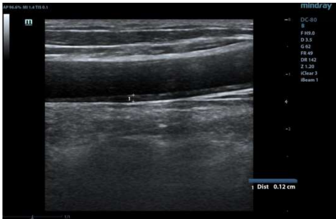
Fig.2: Increased IMT in left common carotid artery