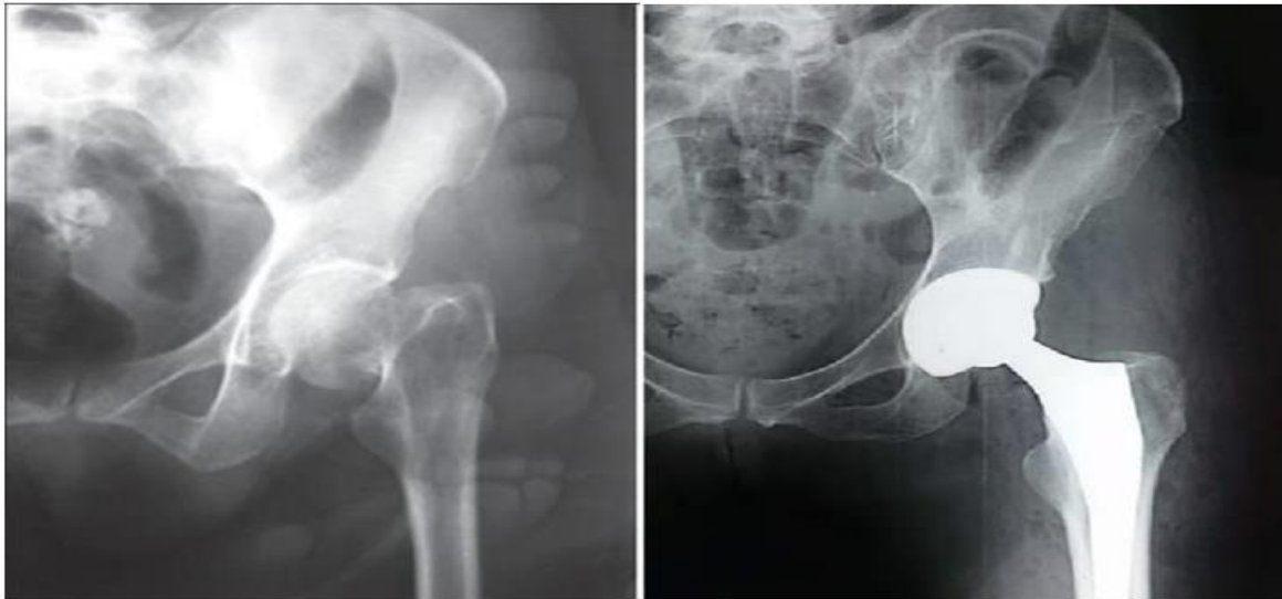
Preoperative and postoperative cement less Total hip arthroplasty for fracture neck femur