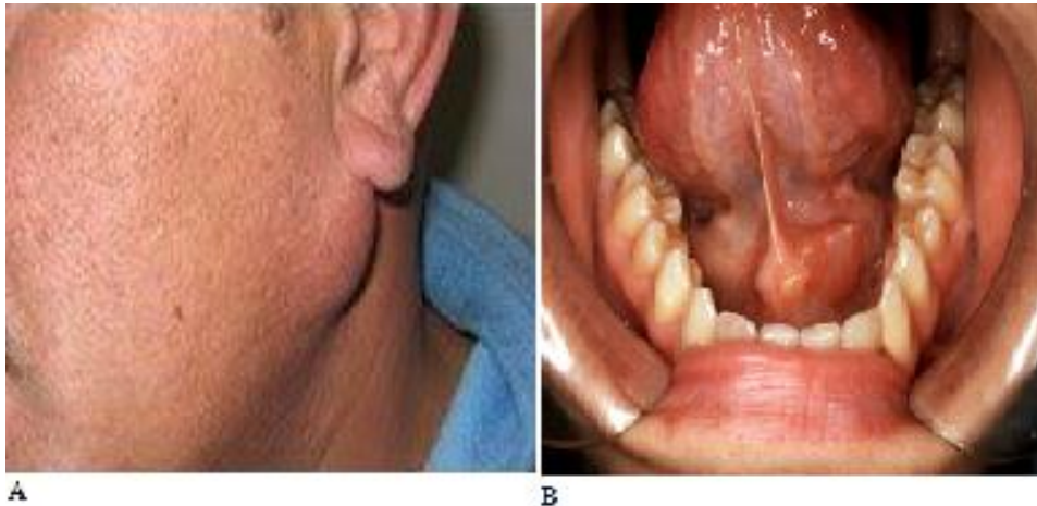
Figure (1): A) swelling in the parotid region and below the ear lobe clinical picture. B) Swelling in sublingual area clinical picture

total of 20 cases are considered benign (Figure 3) and only 4 cases are malignant (Figure 2B). Pleomorphic adenoma is considered as the major benign salivary gland tumor identified in submandibular and parotid glands. The results have been indicated in this work, in which pleomorphic adenoma is the major benign salivary gland tumor at all locations. From the overall 26 pleomorphic adenomas in this work, most of them happened in the parotid gland (20 cases) succeeded by sub-mandibular gland (6 cases). In addition, the mucoepidermoid carcinoma can be specified as the major malignant salivary benign tumor typically showing no pain or other painful symptom which the patients don't care for, and thus, they present late to a concerned specialist[14,15].