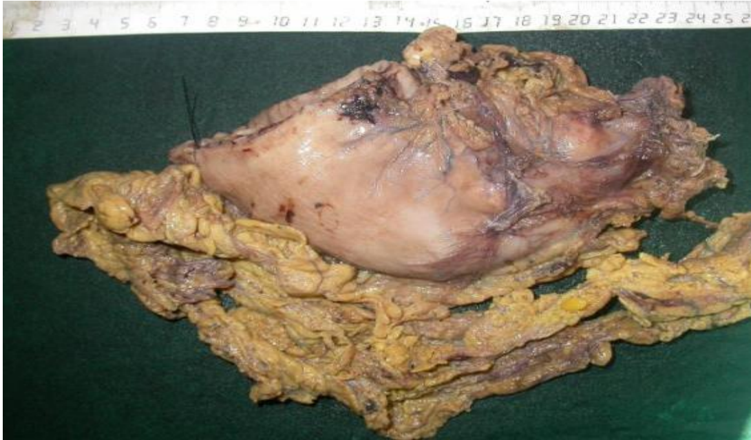
Figure 1- Partial gastrectomy specimen with omentum showing ill defined nodules