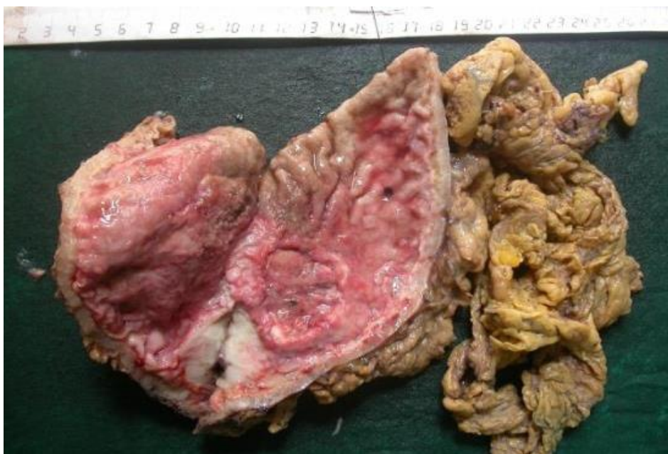
Figure. 2 Cut section showing greywhite growth: adjacent to it seen an ulcer with heaped up margin (Borrmann Type3) and ulceroproliferative lesion