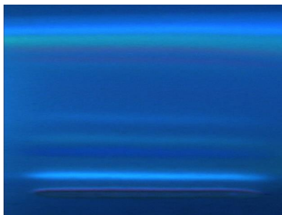
Gokshuradi Guggulu FIGURE 3