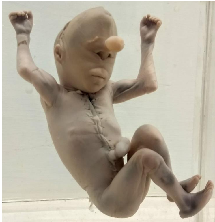
Fig. 05 : Cyclops