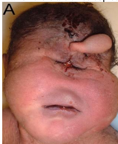
Fig.01: Proboscis in Patau syndrome. Cyclopia correlated in addition to having no nose as well as snout development over the eyeball.

Cyclopia is a rare congenital anomaly known as Holoprosencephaly/ Alobar Holoprosencephaly occurs when forebrain does not cleave into two equal Cerebral hemispheres, Thalamus and Hypothalamus. One-third of babies with Cyclopia / other kind of Holoprosencephaly, cause identified as an abnormality with their chromosomes. Holoprosencephaly more common when there are three copies of chromosome 13.