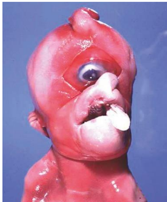
Fig.02: Cyclopia namely a Foetal hog