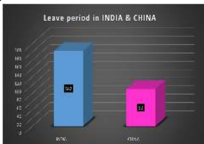
Chart No: 3