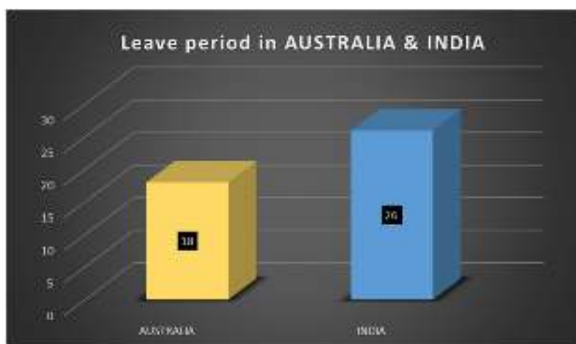
Chart No: 2