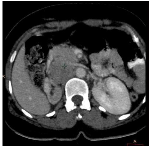
FIGURE: 2. LEISON IN CECT ABDOMEN