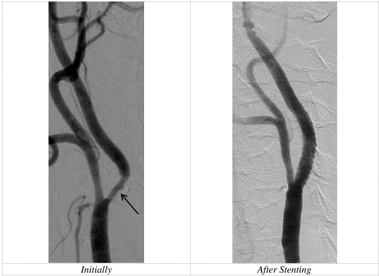
Fig. 2 Arteriography of the right carotid artery before and after endovascular intervention (arrows indicate the area of stenosis)

Considering the above, it was decided to stent the right ICA with transluminal balloon angioplasty of the tibial arteries of the right lower limb. Retrograde left femoral access puncture a. femoralis communis with installation of 6F introducer. After the insertion of the guide-introducer into the lumen of the right CCA, a distal protection system with the subsequent implantation of a self-expanding stent 6.0x9.0x30 was performed through the stenosis of rICA. Before completion of the procedure, post-dilatation of residual stenosis was performed. On the control angiograms there are no signs of distal embolization, the neurological symptoms of the patient are unchanged. The initial carotidography and stenting results are shown below (Fig. 1)