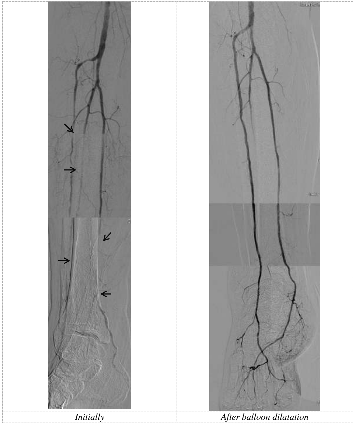
Fig. 3 Arteriography of the tibial and femoral arteries before and after endovascular intervention (arrows indicate areas of stenosis and occlusion)

catheter 5F was performed below the popliteal segment before tibial artery bifurcation. A 3.0x100 balloon catheter with dilatation along the entire length was delivered to the coronary conductor in the zone of stenosis of the ATA. The exposure time of the balloon is 5-7min. Similar actions were implemented in the PTA. On the control arteriograms, the restoration of the main contrast of ATA and PTA was noted (Fig. 2).