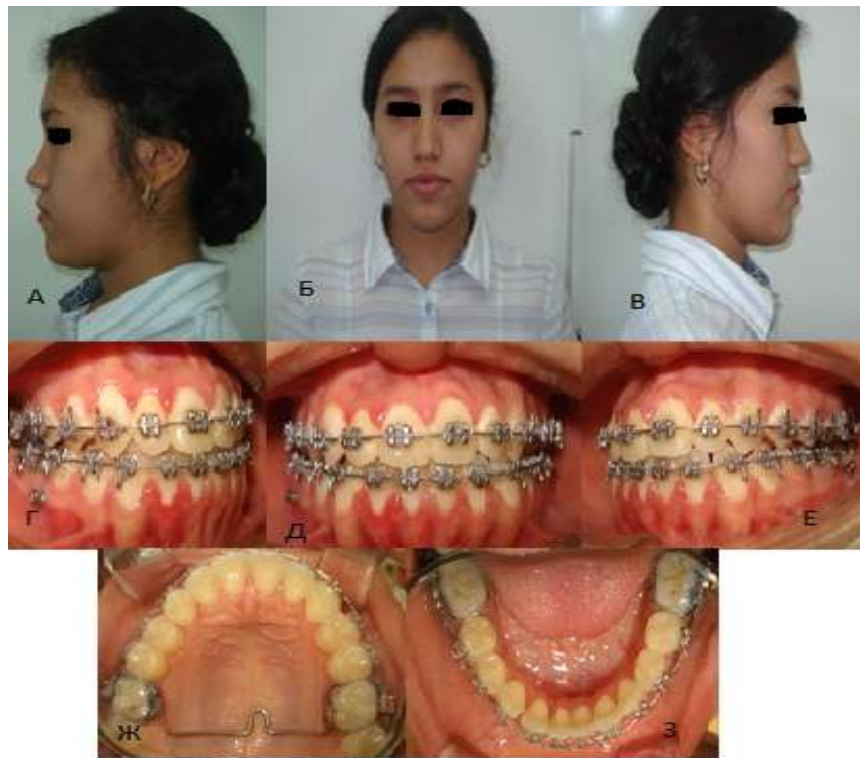
Pic. 5. Patient's front view after the treatment (a), face view on the sides after the treatment (b, c), incisal overlap reached (e), the view of the occlusion on the sides, the ratio of tusks in class I (d, f), the view from above the upper and lower arch of the tooth, crowding between the front teeth is eliminated (w, z).

After 16 months of intrusion of molars with intermandibular elastics and total distalization of the lower jaw with elastics of class III, an orthognatic bite with normal overlap of the front teeth was obtained (Picture 4 a, b).