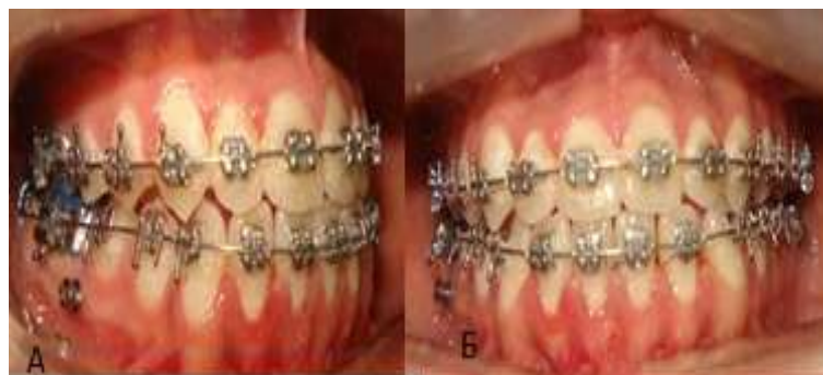
Pic.4. Intra-oral pictures during 15 months of treatment, insignificant incisal overlapping (a, b) was achieved.

To achieve levelling, a 0.14 mm Niti arc was installed, a 0.18 mm Niti arc was installed after 1-2 months, a 0.17 x 0.22 mm Niti arc and a 0.18 x 0.22 mm SS arc were installed after 1-2 months. At the end of the leveling stage, having determined the location of microimplants, four microscopic screws were installed in the alveolar process between the first and second molars perpendicular to the cortical plate of the alveolar process. In the levelling stage, small forces were applied directly to the molars on both sides of the upper jaw, connecting an elastic chain between the molar cheek tubes and microimplants (the elastic chain took the form of a V) (Picture 4a, b). The palatine and lingual arcs prevented the cheek bend of chewing teeth.