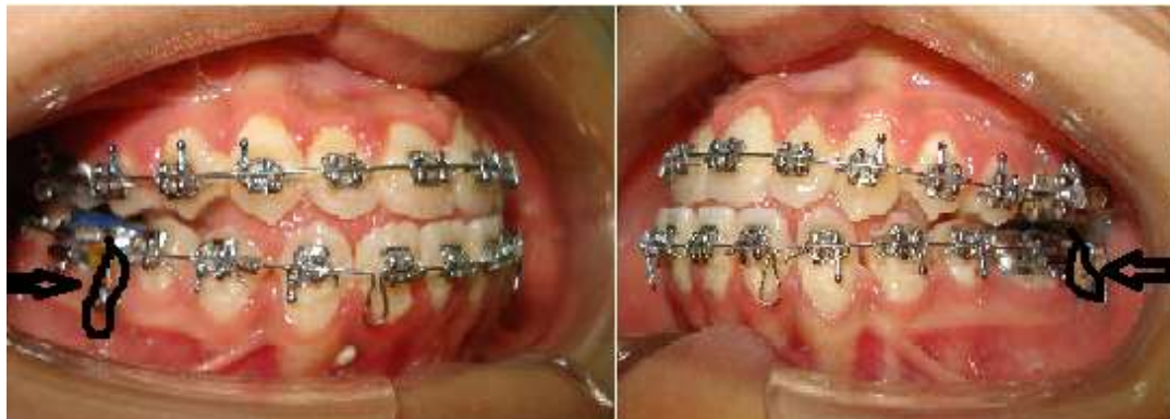
Pic. .3 a. Patient B. with a mesial frontal open bite at the stage of brace system treatment. The black arrow indicates the direction of the vertical gum from arc to microimplants.

We decided to implement morphological changes, in particular the dentoalveolar compensation with an injection of upper and lower jaw molars, by placing microimplants between the first and second molars of the upper and lower jaw (creation of stationary support) and thus reducing the vertical gap between the front teeth (Picture 3a, b).