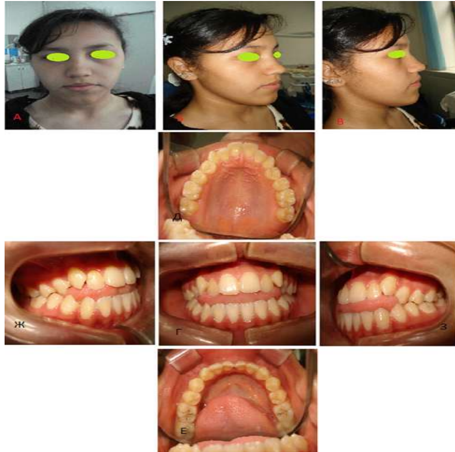
Pic. 1. Pictures of the patient's face: front view (a), side view (b), in profile (c), front view of the tooth rows (d), vertical slit between the front teeth, when swallowing you can see infantile swallowing; a dystopia of canines, extrusion of chewing teeth (w, z), top and bottom view of the upper and lower rows of teeth (e, f, g), crowding of the front teeth.

When examining the face, no displacement from the median-sagittal line of the face was revealed, there were no symptoms of temporomandibular joint disorder. During the examination of the oral cavity - pale pink mucosa, the transitional fold and pulls do not have any deviations from the norm, the frenulums of the tongue and lips are normal length, cheek bumps of chewing teeth of the upper arch overlap the cheek bumps of lower chewing teeth, the ratio of the first molars and tusks to Class III Engle. In the frontal area, there is a vertical slit from 1.5 to 5 mm, as well as a reverse sagittal slit from -0.5 to -3 mm. The upper front teeth were normal or in protrusion, the lower front teeth - in retrusion. The cephalometric analysis revealed that children had a hyperdivergent facial shape with moderate skeletal anomaly class III with a small ANB angle. The lower jaw incisors were moderately lingual to compensate for skeletal sagittal divergence (Picture 2).