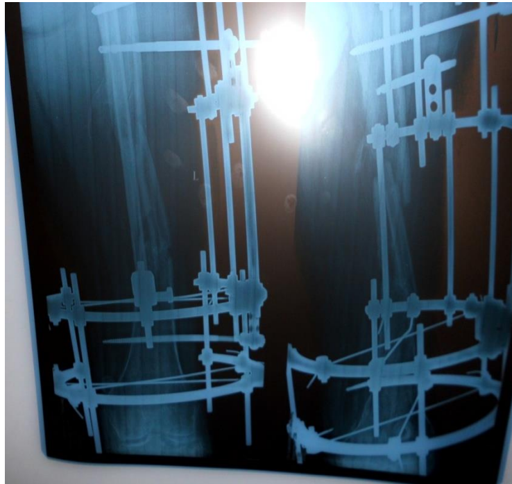
Fig. 2. 21.07.2015y. Patient was born in 1983. Radiograph of the left femur, after surgery, anteroposterior and lateral views.

In the stationary period, the patient underwent detoxification, antibacterial and restorative therapy, antiplatelet agents, antispasmodics, anticoagulants, as well as local treatment of wounds after surgery. The patient was activated on the 5th day and was under observation. 6 weeks after the operation, a course of early functional loading was started by passive movements of the knee and hip joints with a gradual increase in the range of motion in the adjacent joints. Fixation with the apparatus was carried out for 12 months with supportive compression. Then the device was dismantled.