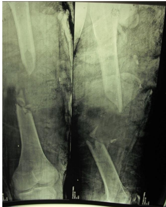
Figure: 1.13.07.2015y. Patient was born in 1983. diagnostic radiograph of the left femur.

In 2015.07.13 the patient was admitted to the traumatology and orthopedics department of the medical center, in Samarkand. Diagnosis: Closed craniocerebral injury (CCCI). Brain concussion. An open comminuted fracture of the femur, with an extensive defect in the bone tissue of the diaphysis in the middle-lower third. Type II is according to the classification of open fractures according to Gustilio-Anderson [10]. A diagnostic radiograph of the left femur was performed, anteroposterior and lateral projections (Fig. 1).